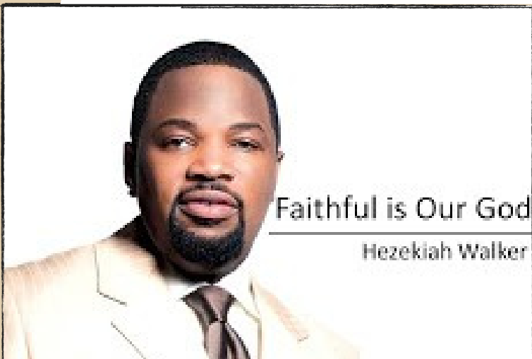
Faithful is Our God

Yes, I rejoice today, for I shall recover it all “